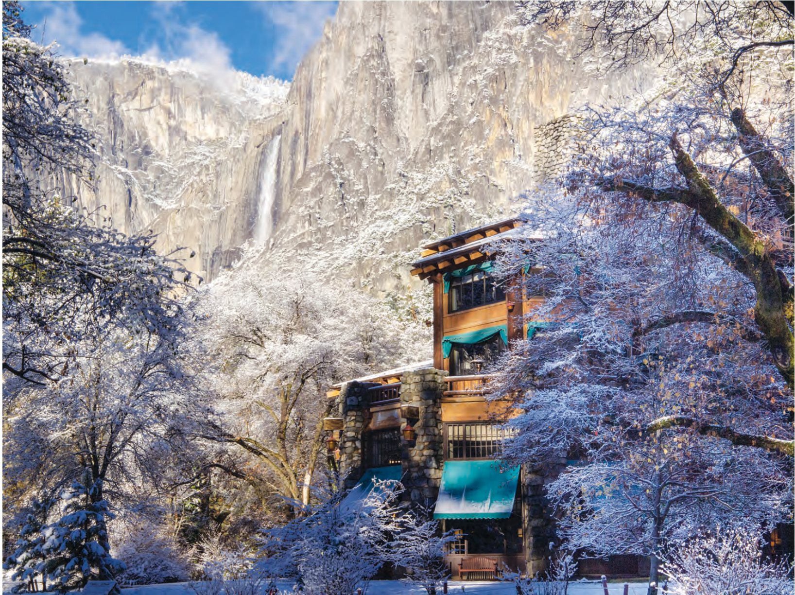
Some national parks, mostly but not all in the West, have historic hotels, many of which are architectural landmarks. Ahwahnee Hotel, Yosemite National Park (California).