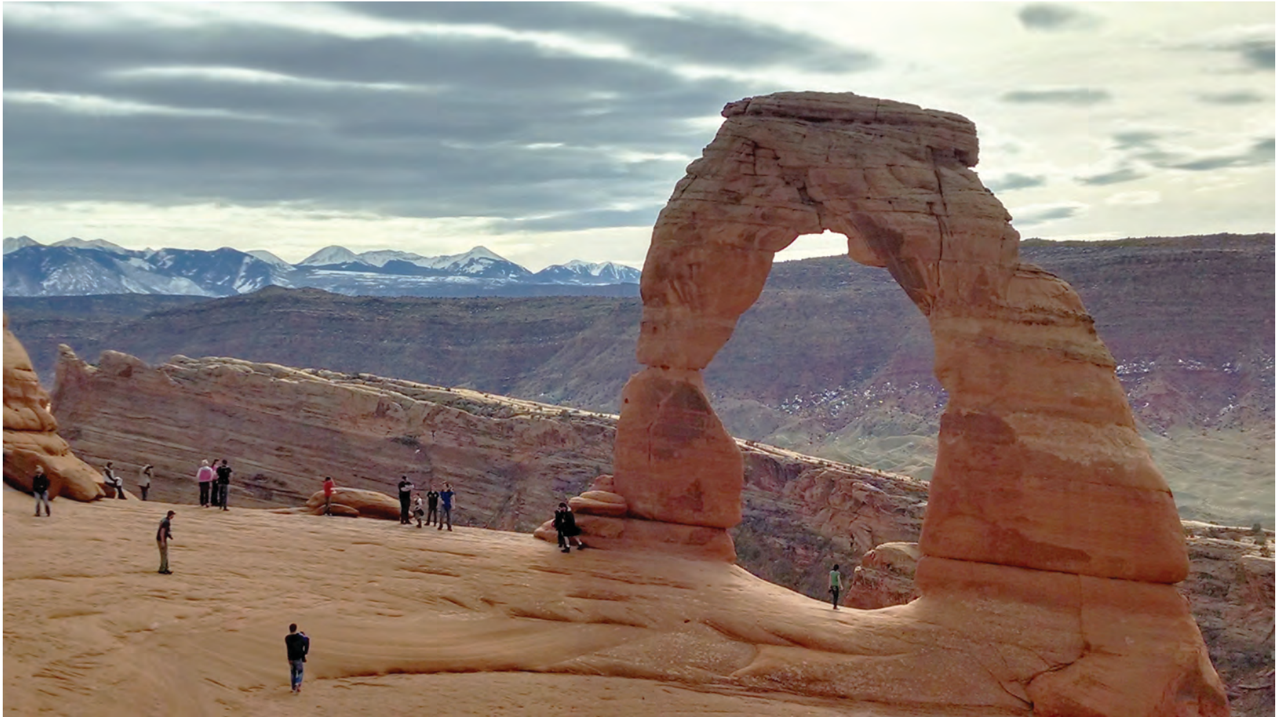
Some of the nation's most unforgettable and iconic natural wonders can be reached by a national park trail. Delicate Arch in Arches National Park (Utah).