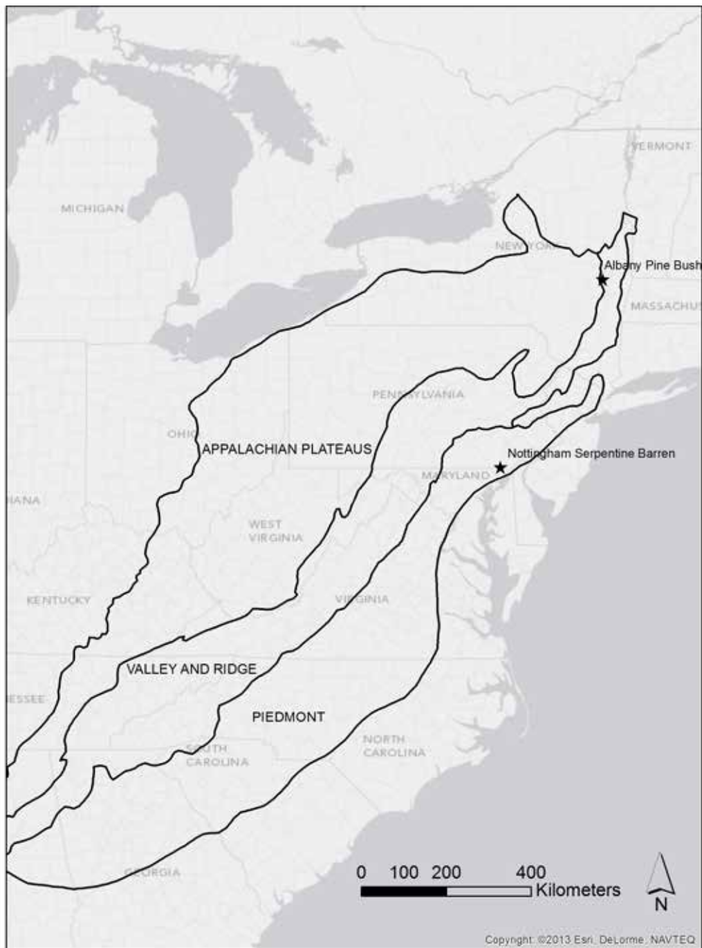
Figure 1. Map of three physiographic provinces assessed and two barrens study sites.

strates how the NNL program provides a highly structured but flexible system for the continued expansion of this catalogue of the country’s diverse natural landscape.