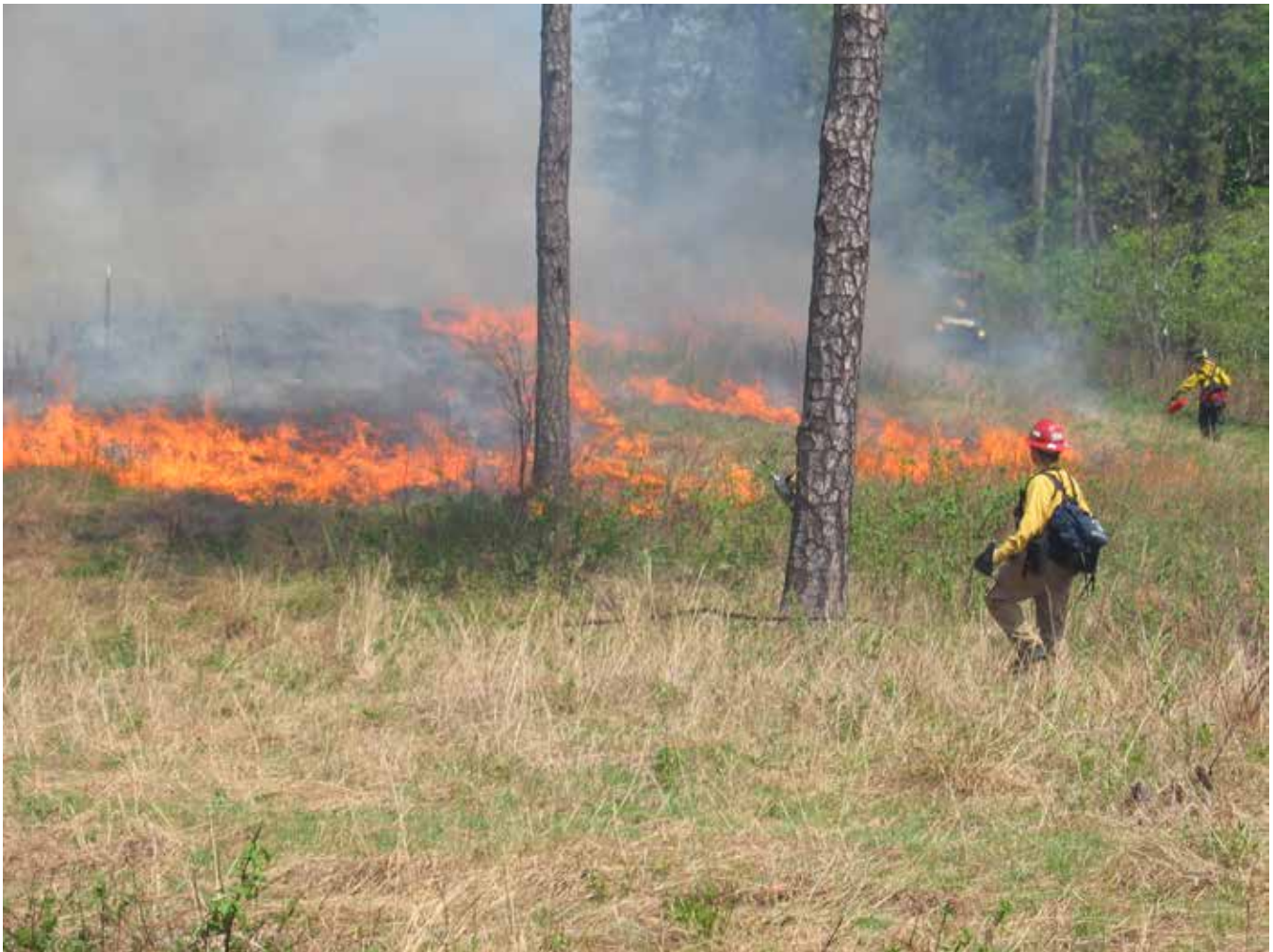
Figure 3. Prescribed fire management in the Albany Pine Bush Preserve.

2010). Ongoing partnerships fostered by the unique land ownership aspects of the NNL program would encourage threatened sites such as these that are paramount to the nation's natural history to share information and solve problems cooperatively.