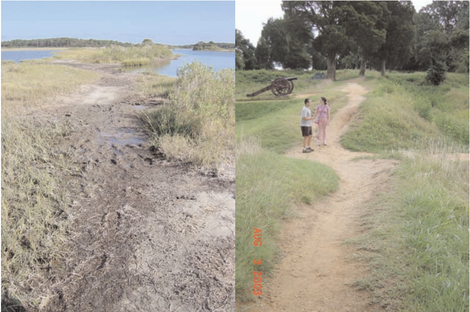
Figure 1 (left). Trail erosion at Assateague Island National Seashore.