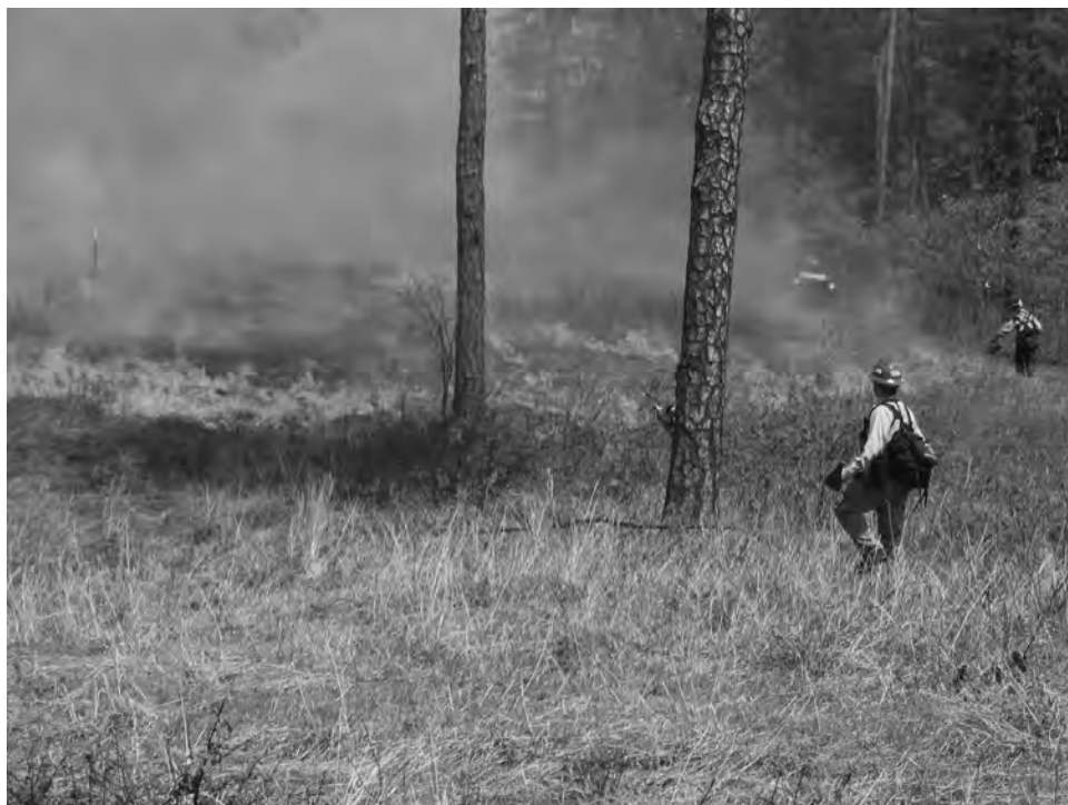
Figure 3. Prescribed fire management in the Albany Pine Bush Preserve.

tinued to burn parts of the Nottingham landscape throughout this historical period of fire suppression. Ongoing prescribed burning at the site provides an excellent opportunity to educate the public on the role of fire in natural ecosystem processes. Like Albany Pine Bush, the site is also host to a wide variety of birds, mammals, moths, butterflies, amphibians and reptiles including at least 33 that are rare globally or within the state. The site is included within an Audubon Society of Pennsylvania Important Bird Area.