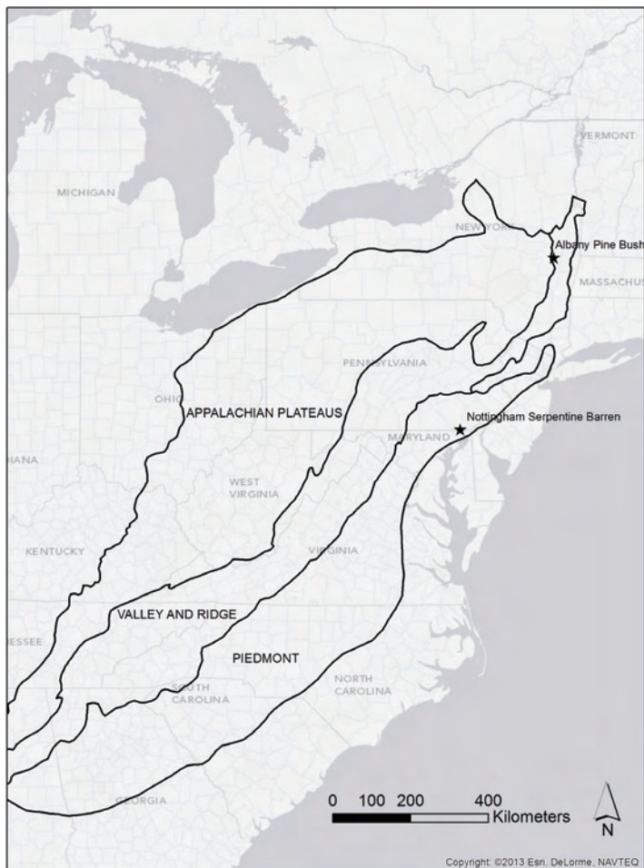
Figure 1. Map of three physiographic provinces assessed and two barrens study sites.