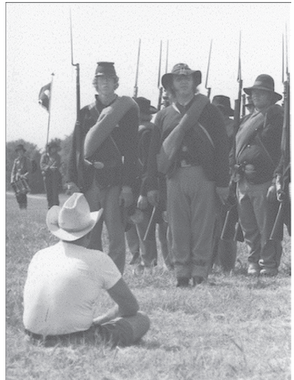
Figure 2. Living history program at STRI, circa 1970.

other aspects of park interpretation. During the Civil War centennial, living history programs became very popular at Civil War military parks. While NPS management hedged away from “sham battles” by putting in place a policy that prohibited re-enactments on park lands, that policy did not quell Civil War enthusiasts’ desire to act out the past. NPS interpreters also recognized the utility of re-enactments to portray a more human aspect of war. To meet both needs, NPS began incorporating living history demonstrations into park programs all across the country in the mid-1960s. It is unknown when the first living history program was offered at STRI, but these programs were in full swing in the 1970s (Figure 2). Initially the park held firearm demonstrations, but expanded to cavalry and artillery programs, which were popular among visitors. Volunteers in Parks (VIPs) were instrumental in implementing these programs. Some of them