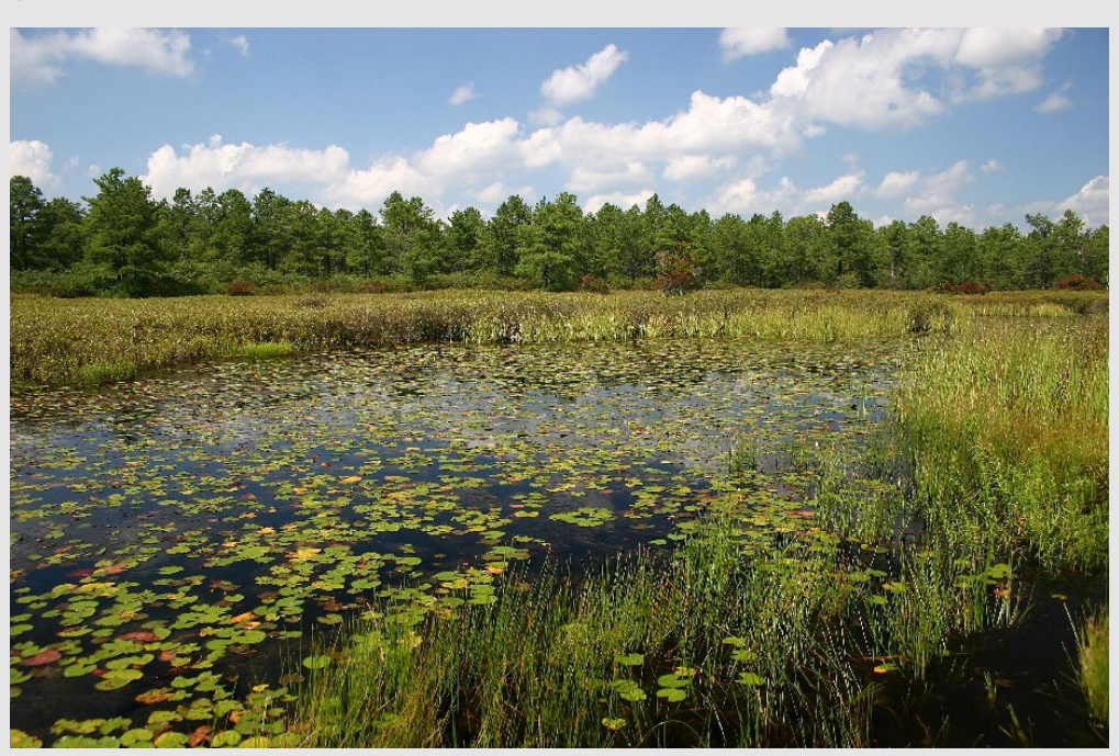
Paramecium Pond, New Jersey Pinelands.

The New Jersey Pinelands Commission is the primary agency that oversees land use in the Pinelands Biosphere Reserve. The Pinelands Comprehensive Management Plan, or CMP, contains land-use and environmental regulations that are designed to balance economic needs with the mission of preserving and protecting the region's many resources.