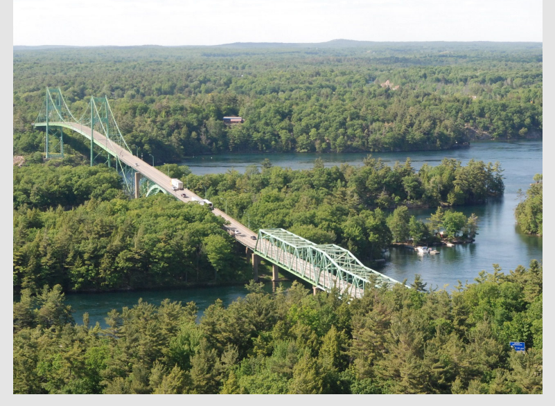
Thousand Islands International Bridge between New York and Ontario. St. Lawrence River, U.S.—Canada border.